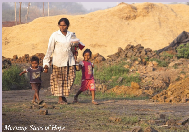
Morning Steps of Hope

A visual ethnographic approach has been used for the documentation, including informal interviews and conversations. The project reflects a personal take based on the conversation and interactions with the participants at the brick kiln. The Photobook Project attempts to look closely at Brick workers' lives at the Brick Kiln and tries to capture the Mundane activities at the site, the hardship and struggle of families, moments of shared joy, togetherness and living experiences of the brick workers.