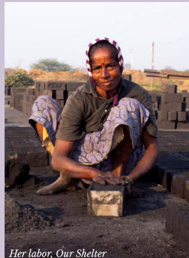
Her labor, Our Shelter

Nearly thirty workers from the Krishna District of Andhra Pradesh and their families live and work at one of the Brickkiln near Mamidipalli Tanda, Sangareddy, Hyderabad. The place is filled with chaos, multiple living experiences and fleeting moments. The only struggle is to look at what lies beneath! Where multiple stories unfold simultaneously. The challenge is not just to document what meets the eye but to look beyond—to explore the underlying emotions, aspirations, and silent narratives that define their lived experiences.